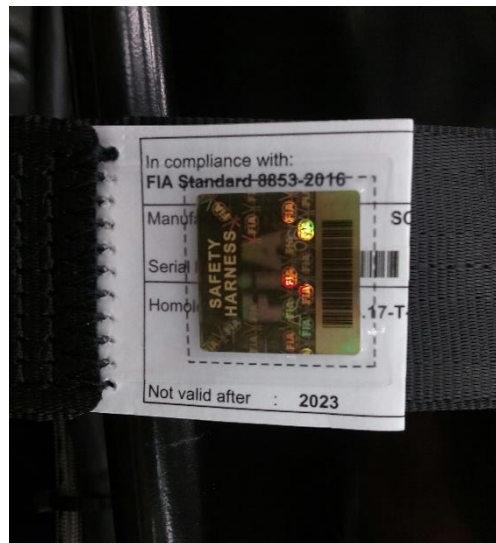
Figure 2 – Holographic Label

For parts supply please contact: stores@radicalsportscars.com